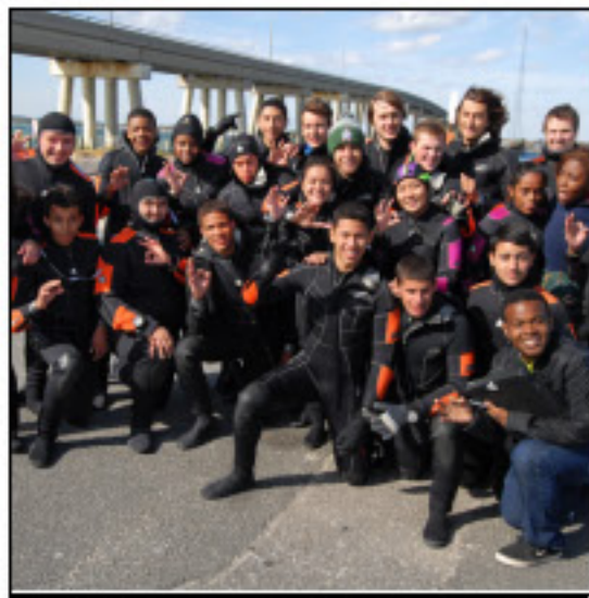
HARBOR SCHOOL STUDENT DIVERS