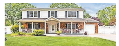
South Setauket - Available