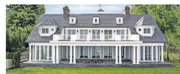
Llyod Harbor - Available