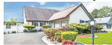
Ronkonkoma - Sold