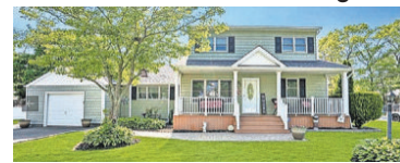
Holbrook - Sold