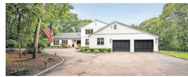
Belle Terre - Pending