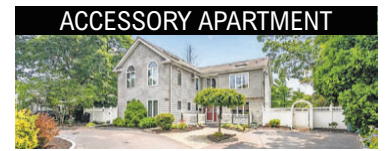
Deer Park - Pending