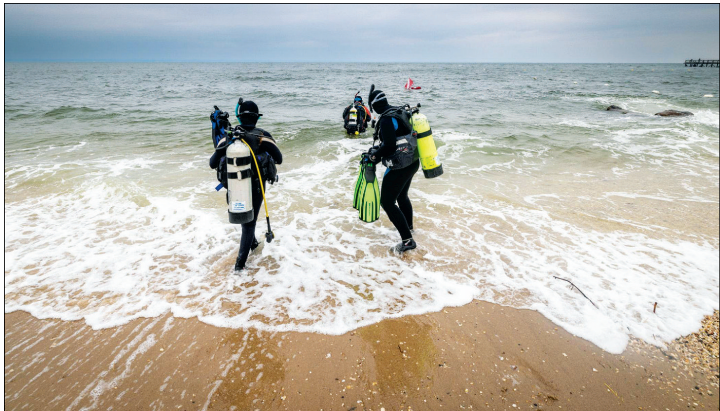
Scuba diving students enter the open water for the first time at Pribil Beach in Glen Cove.

These associations largely have the same standards, but scuba schools have different requests of students, with some requiring them to have their own masks and flippers, for example, and others finding it easier to help beginners get