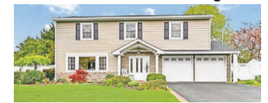
Lake Grove - Sold