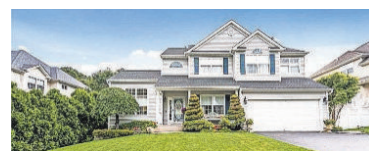
Manorville - Available