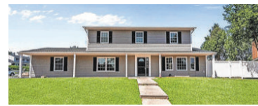
Lake Grove - Pending