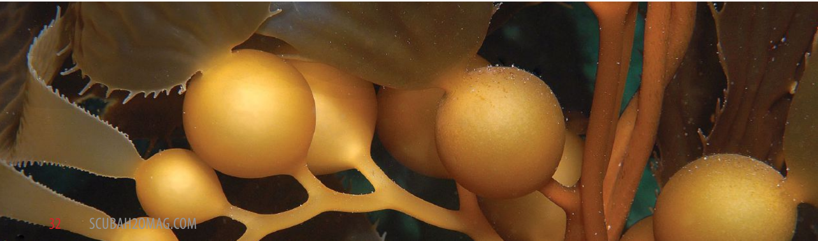
There are dense stands of Kelp off Catalina

Besides the usual array of southern California marine life,