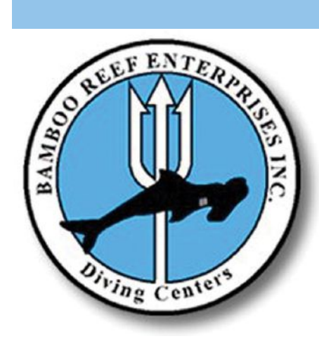
We have been serving SCUBA Divers from around the world since 1961!