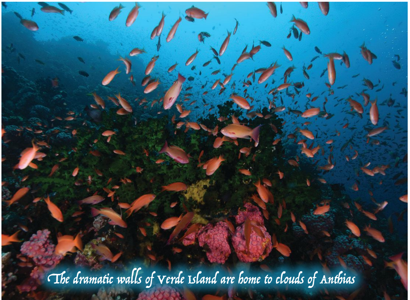
The dramatic walls of Verde Island are home to clouds of Anthias