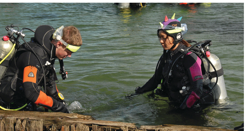
Students get ready to dive