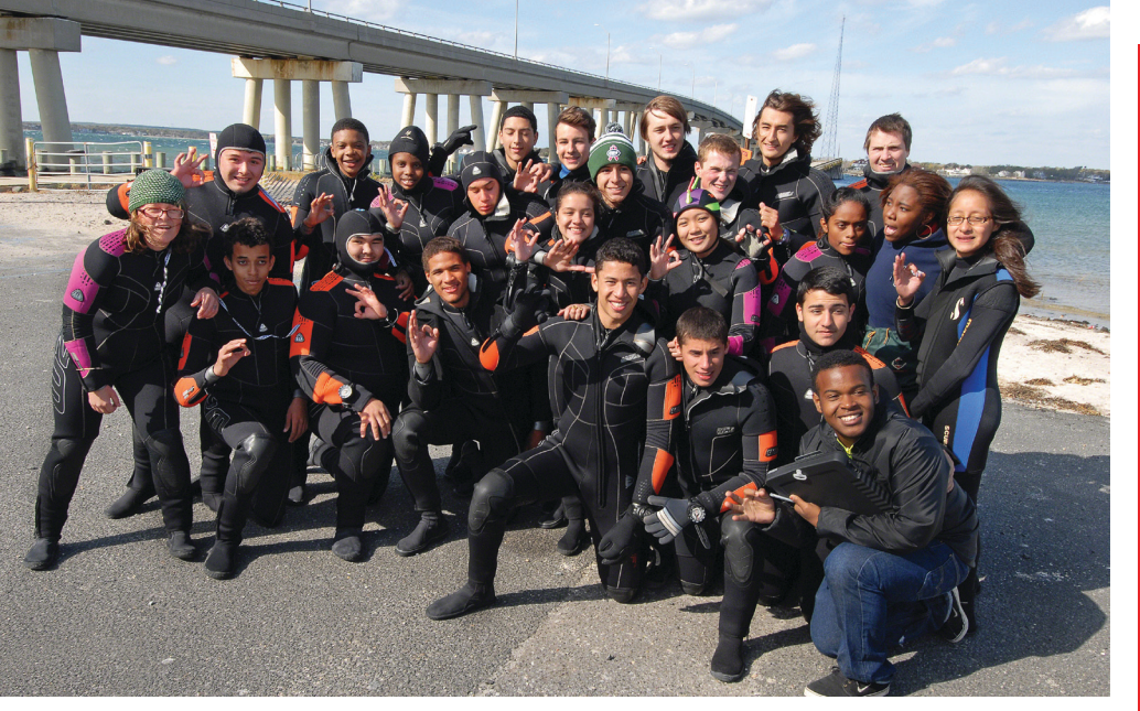
Harbor School student divers