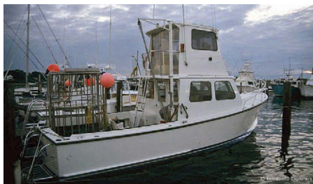
Snappa Charters with Shark Cage, RI