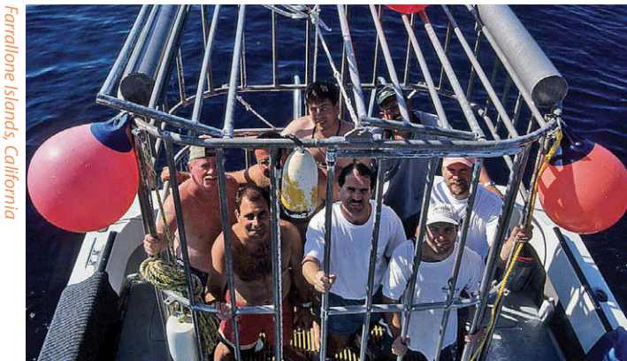
Farallone Islands, California