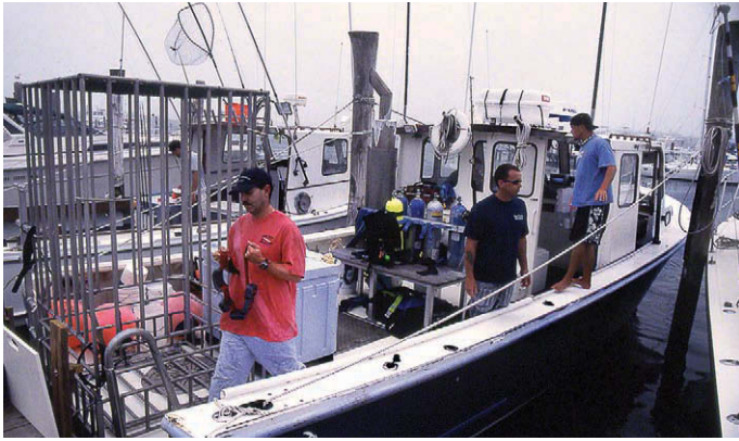
Sea Turtle Dive Boat with Shark Cage