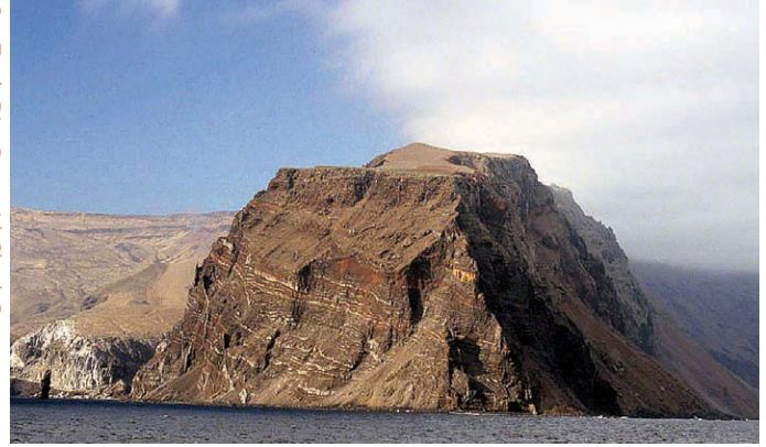
Guadalupe Island, Mexico

The trips to Guadalupe are multi-day affairs, and over the course of several days, divers will experience these creatures in all of their magnificent glory. Great White Adventures / Shark Diving International operates a variety of cages, from two-tandem surface cages attached to the stern, to deep submersible cages that put divers right inside the action by dropping them down 20 feet or more below the surface. They also offer a new shark diving underwater craft called the "Pelagic Explorer". The Pelagic Explorer is a self-propelled shark cage (SPDC) that allows the serious photographer or videographer a chance to get up close and personal to Great White Sharks.