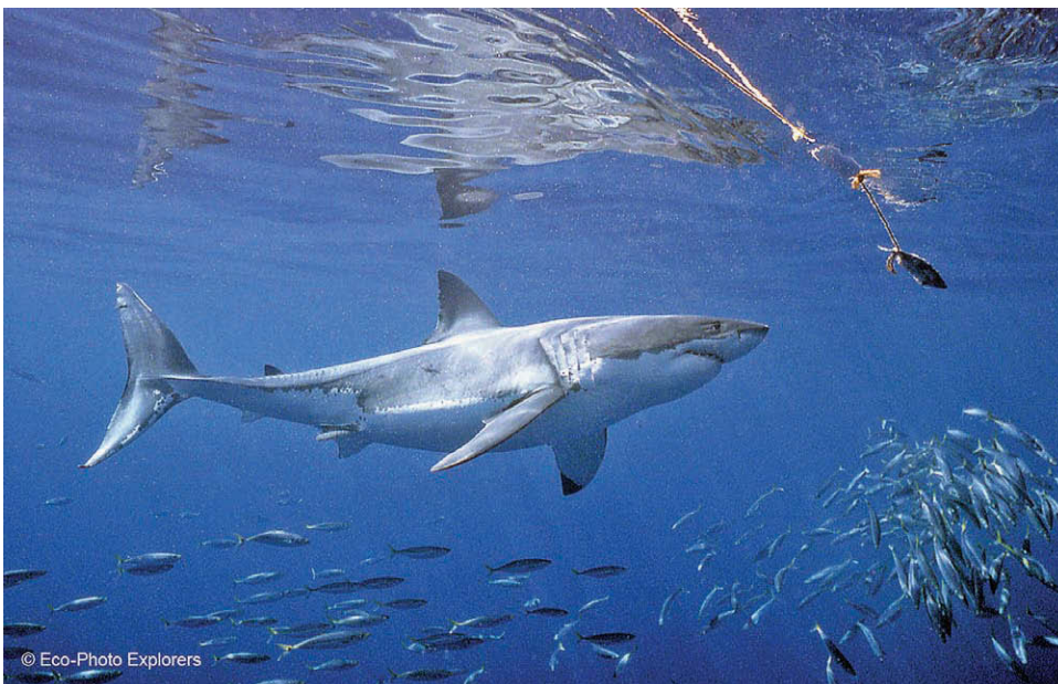
Great White Shark Taking Bait, Guadalupe Island, Mexico

Here, the diving is surface supplied or "Hookah" only. Water temperature averages 52-56 degrees F. The water is not warm and a dry suit is the best option for a comfortable day in the cage.